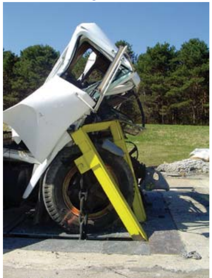
Two things compromise structural integrity; rust and steel deformation (caused by a traffic accident).

Concentric Security’s engineers evaluate a barrier’s structural steel, the critical element for its ability to meet its as-tested crash rating.