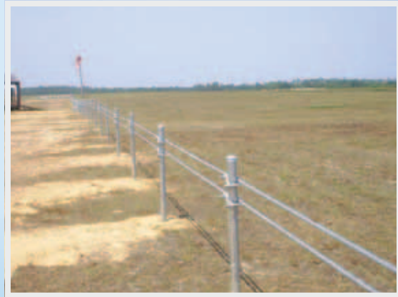
FIXED BOLLARDS REQUIRED FOR ALL CORNER INSTALLATIONS

56% LESS RESISTANCE CAPACITY THAN AMERISTAR STALWART ALTERNATIVE