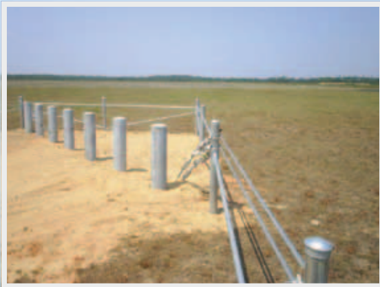
CONTINUOUS TURNBUCKLE TENSIONING ADJUSTMENTS REQUIRED UTILIZING 3/4" CABLES